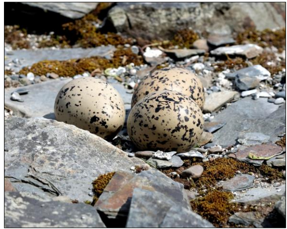
Oystercatcher "nest" & eggs

After navigating some narrow roads and tight bends the coach arrived at the site and we were greeted by the wardens and amongst the information that they provided us with was that this year there were a pair of marsh harriers which were the first that had been there in a long time.