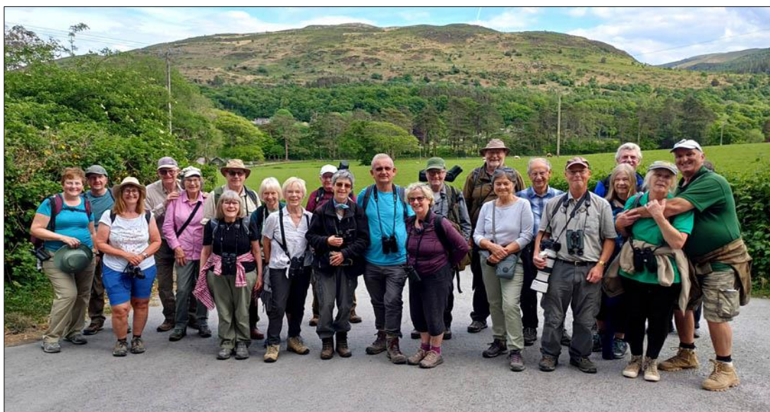
Group at Ynis-hir

In total the group saw 58 different birds with some lucky members seeing the osprey and cuckoo which unfortunately were not on my list for that day but it was still a very enjoyable last coach trip of the season.