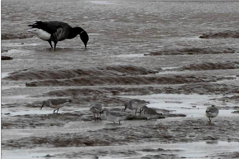
Dark-bellied Brent Goose & Dunlins

The bird of the day for me.....the Dark Bellied Brent Geese.